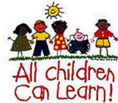
District 66 Special Education Trend Data